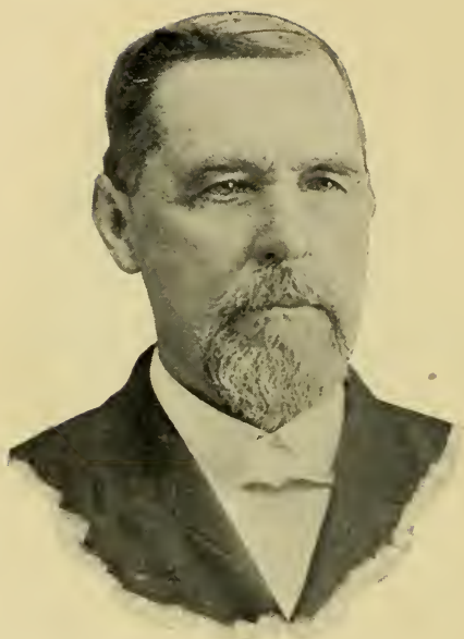
J. B. BOONE, D.D. 1836—1908.